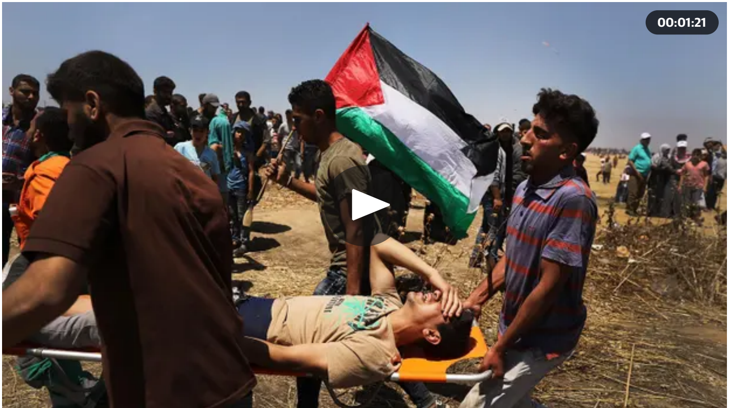
Palestinians killed as US opens embassy in Jerusalem - video report

For years the international community has been talking about a solution based on separate Israeli and Palestinian states coexisting in peace and security. But current Israeli policy renders this impossible. During the 51 years of military rule on the West Bank, Israel has taken over large quantities of land, and has placed around 600,000 Israeli citizens there in hundreds of settlements. It supplies them with roads, water and electricity, has built and financed their health, education and cultural institutions, and has given them the same civil and political rights enjoyed by citizens residing within its sovereign territory.